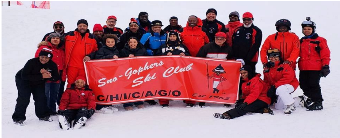
Summit 2024 Big Sky Montana