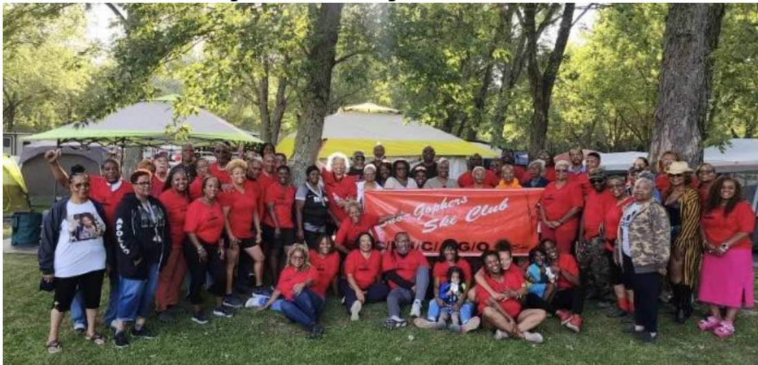
2024 Camping Trip – Indiana Beach Campground